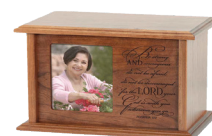
Expression Photo 4x6 Urn