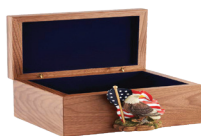
Walnut Memory Box