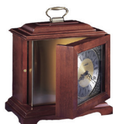
Corbett Mantle Clock